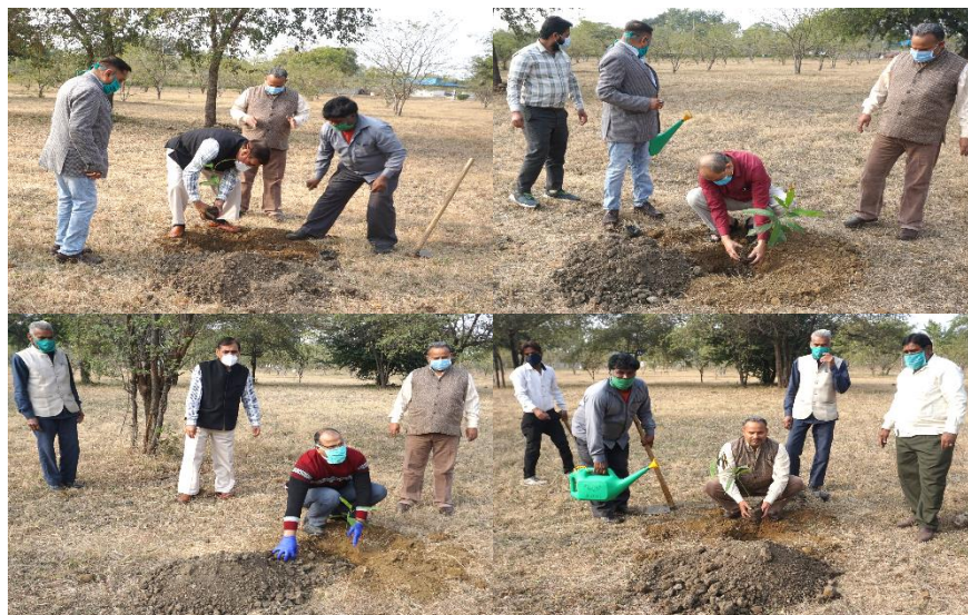
Tree Plantation by the Director and staff in the institute campus